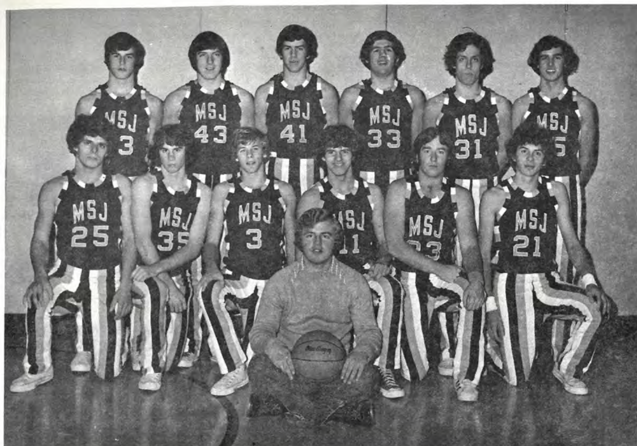
1974 VARSITY TEAM