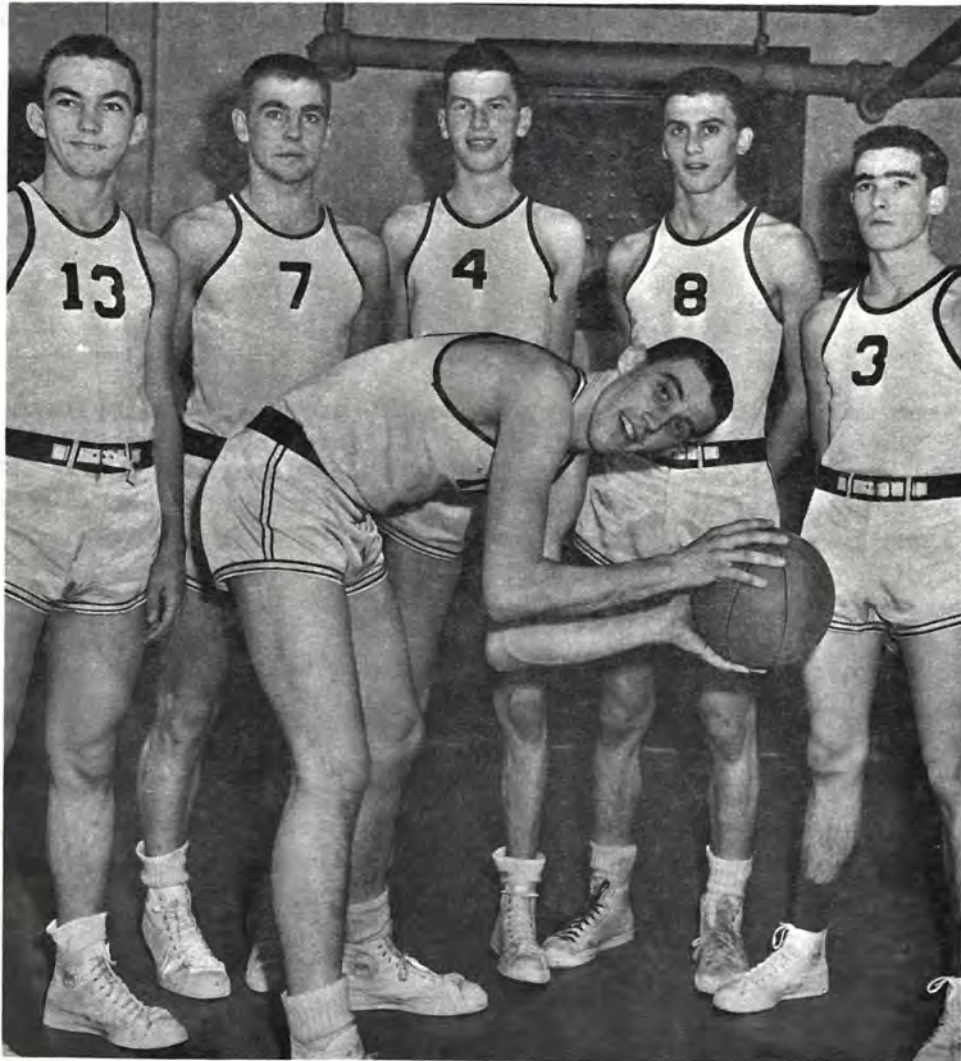
1954 STATE CHAMPIONSHIP TEAM